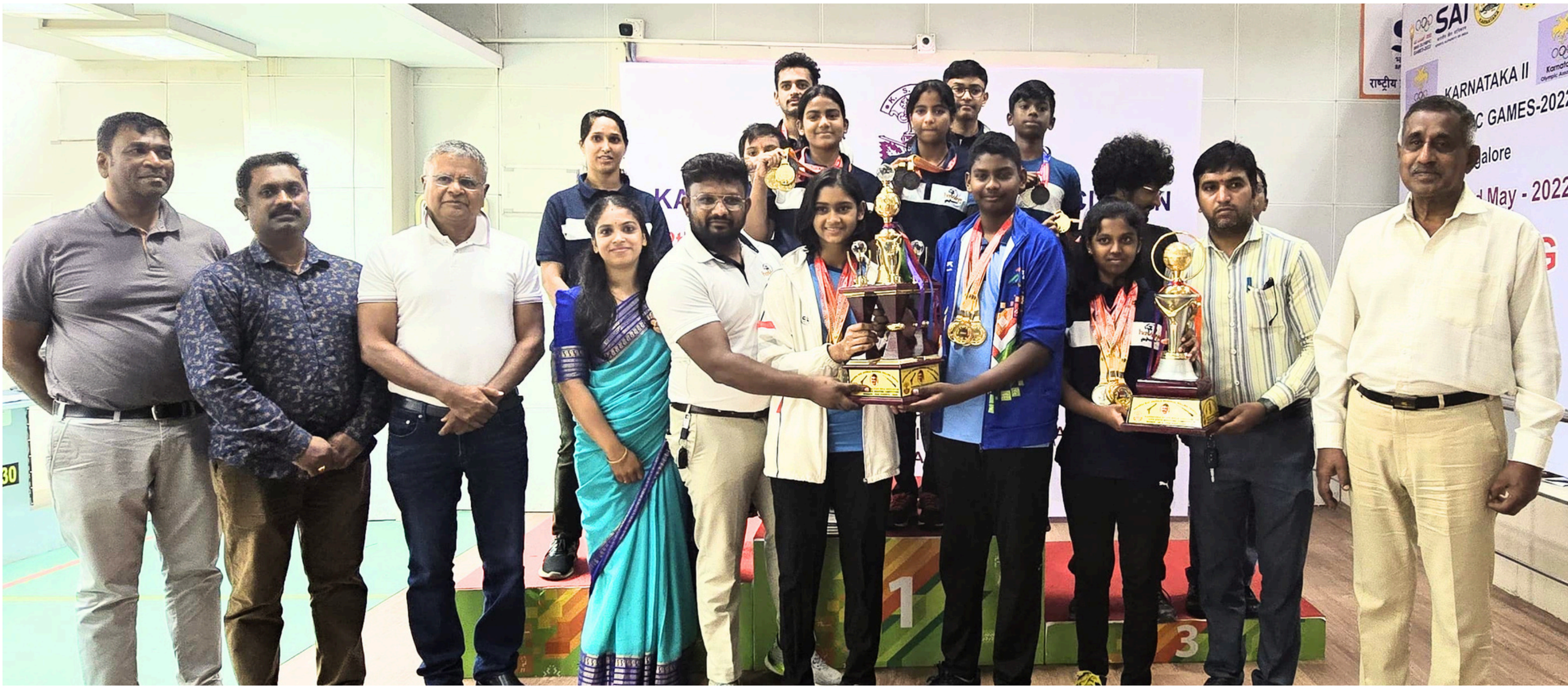
Karnataka State Champions 2024 (ISSF) 28 Gold, 14 Silver, 23 Bronze Continued the legacy with stellar achievements.