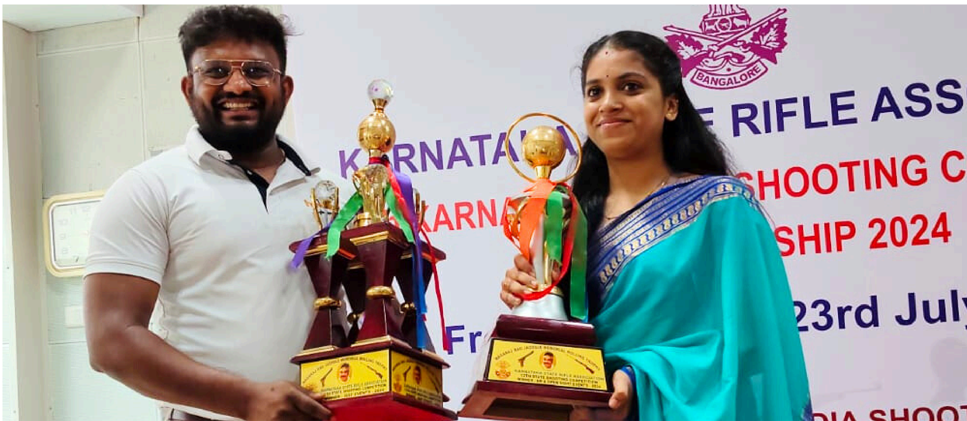
Karnataka State Champions 2024 (NR) 24 Gold, 32 Silver, 28 Bronze Showcased unparalleled consistency and excellence.